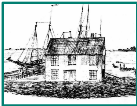
Winsor's Wharf (Snug Harbor), 1848

Read the directions to your driver and explain Duxbury's history as you go.