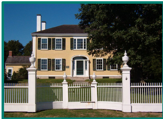
King Caesar House, 1809