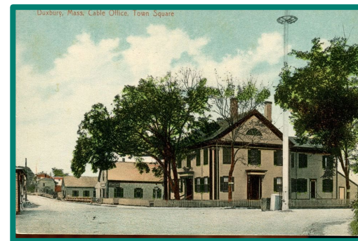
Duxbury Village Postcard, c. 1910

4. Driver, do this: Stay on Washington St. to the Bluefish River Bridge